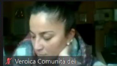
Veroica Comunità dei ...